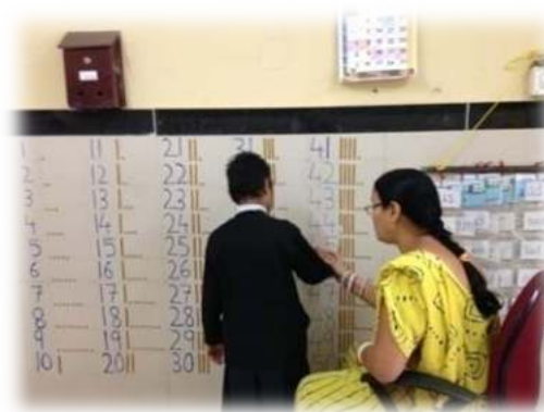
Student being guided by our LRG faculty

The most impactful aspect of our model is 'inclusion'. The Learning Resource Group (LRG) at Muktangan is trained to support classroom teachers in educating students with specific learning-disabilities. They also conduct individual /small group classes to improve literacy / numeracy skills. Autistic and cognitively impaired students are taught life skills and helped with secondary behavioral problems.