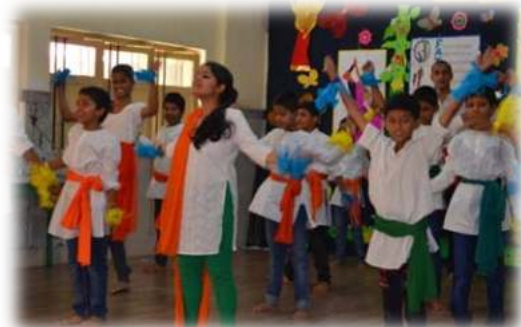
Annual day at Muktangan