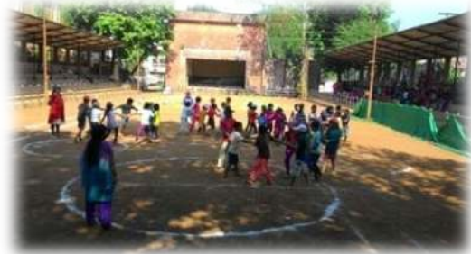
Sports day at Muktangan