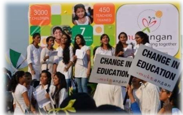
Teacher trainees cheering marathoners

Once again Muktangan put up a Cheering Zone for the Standard Chartered Mumbai Marathon 2015 held on 18 th January 2015 to cheer on all the runners who through their participation in SCMM 2015 have supported Muktangan schools and programs.