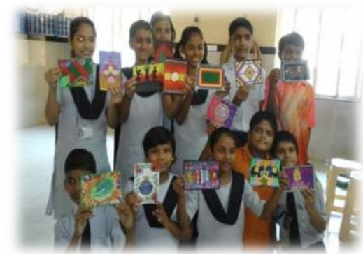
Cards by Muktangan students