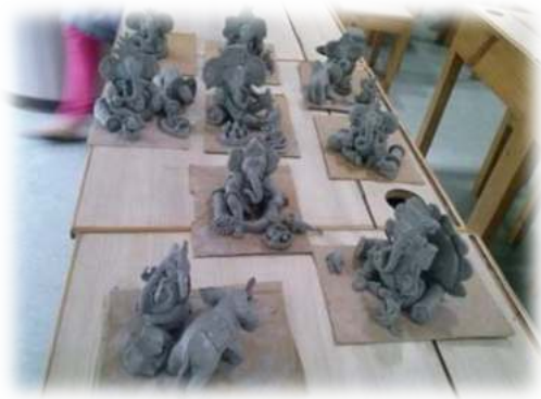
Art workshop for teachers at Somaiya School