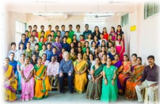
Muktangan students of standard 10, class of 2014-15

time to interact with the faculty and older colleagues. Topics focused on include parent meetings, documentation & Lesson planning. The October PD sessions focus more on the teacher's professional growth. Leadership, management and skill development sessions are conducted for all teachers.