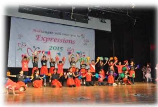
Students performing on stage.