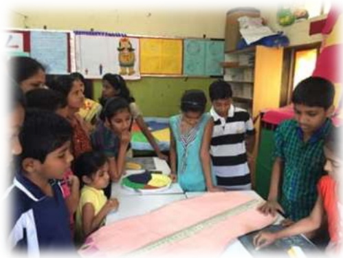
Project day at Muktangan