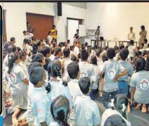
Students participate in a programme organised by Reniscience - as part of the City as Lab initiative - held at Chhatrapati Shivaji Maharaj Vastu Sangrahalaya, formerly Prince of Wales Museum, on Saturday.

Observation and conclusion: They concluded that most people tended to break signals when they were in a hurry and