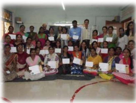
Teachers at the workshops

Muktangan's Teacher Education Centre conducted 5 workshops designed by Muktangan's faculty in early January and February, 2015 based on an active constructive, child-centric methodology and was open to professional educators working in the field. They were created as a powerful intervention tool that would help bring improvements to the regular teaching – learning process.