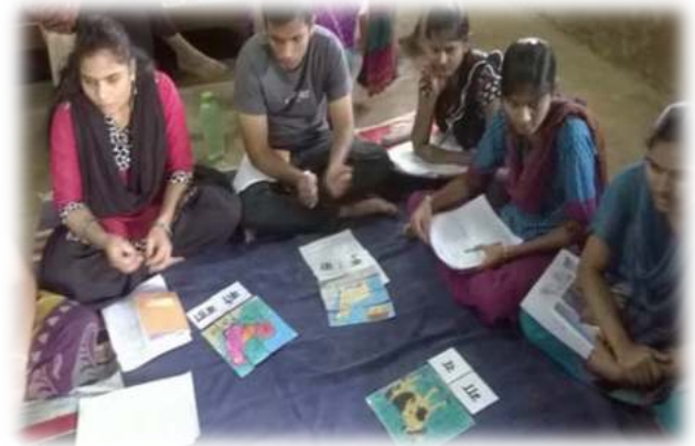
Outreach programme at Wada

Muktangan is in partnership with Learning Space Foundation (Wada, Maharashtra). Here we work with 27 Anganwadis and 23 Zilla Parishad schools (ZP).