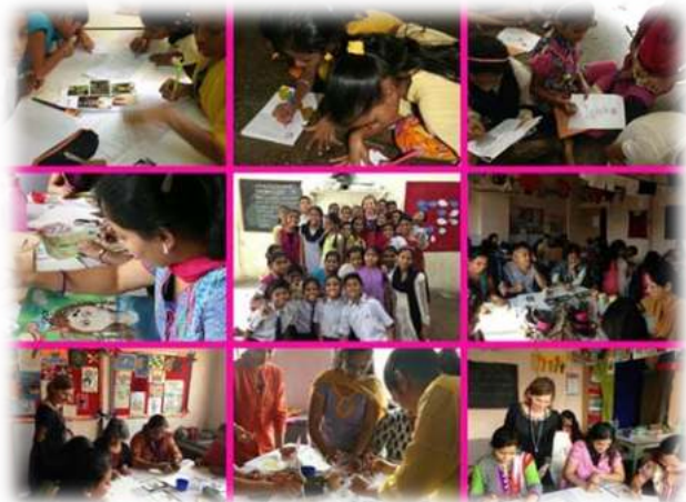
Students and teachers at the art project workshop

Muktangan and St. Andrews C of E High School for Boys, Brighton (UK) once again partnered on their biennale art project and worked with students of standard three and six on exploring their identity through the medium of visual art. The British Council Connecting Classroom Grant made it possible for both the schools to have this staff exchange.