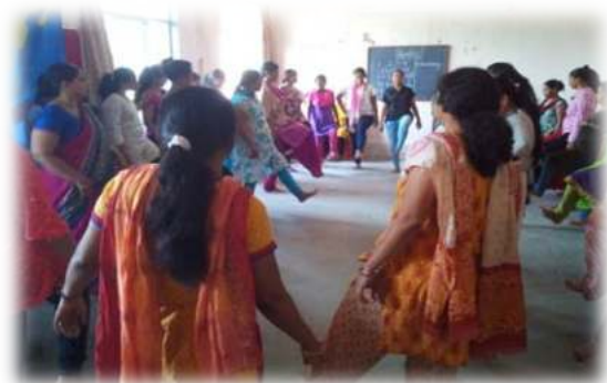
Classroom activities during Professional development workshop for teachers