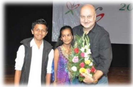
Students with chief-guest Mr Anupam Kher.